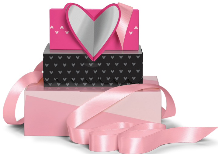
Limited-Edition* Holiday Gift Box Set, $6, pk./3

Three adorable gift boxes in different shapes and sizes – small, medium and large – make it fun to give and receive.